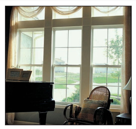
Double-Hung and Transom Windows Bring added height and light to any room setting