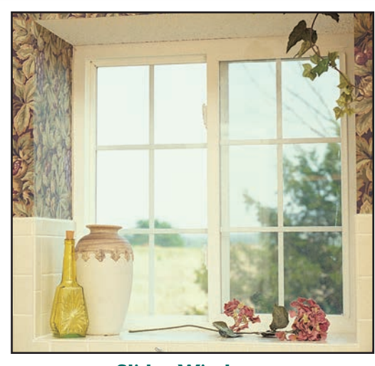
Slider Windows A great choice when space is at a premium