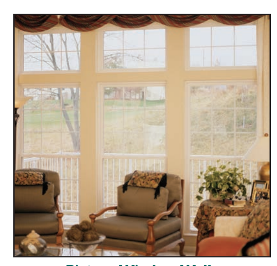
Picture Window Walls Offers maximum viewing area and opens the room to the outside beauty