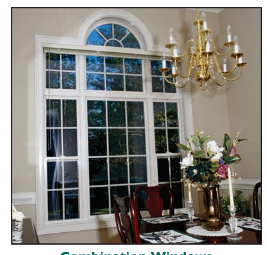
Combination Windows Dramatically emphasize the living space