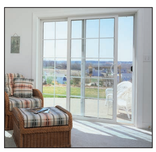
Sliding Patio Door Create light and inspirational views in your living space