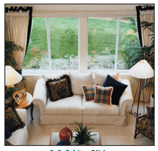
2 & 3 Lite Sliders Create a custom look for a special room